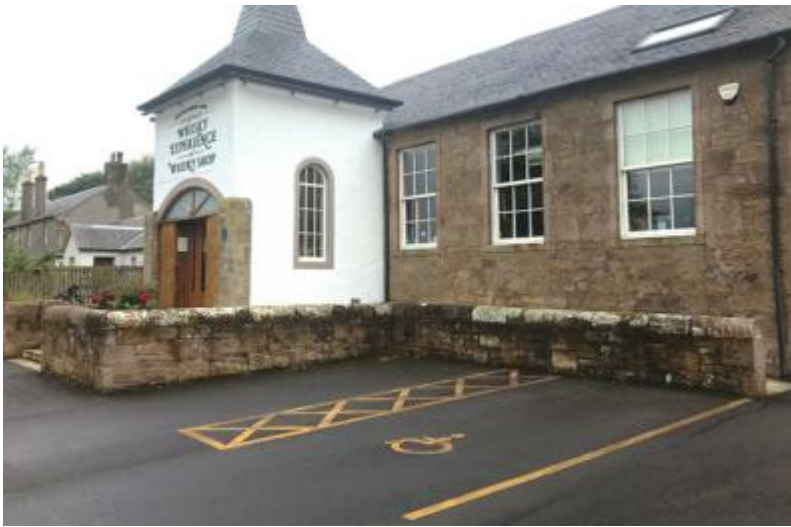
Disabled parking at entrance