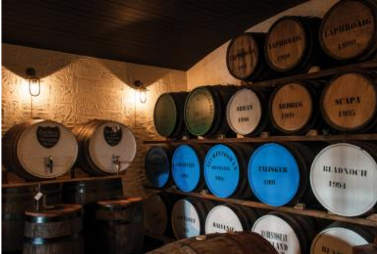
Cask room with low lighting