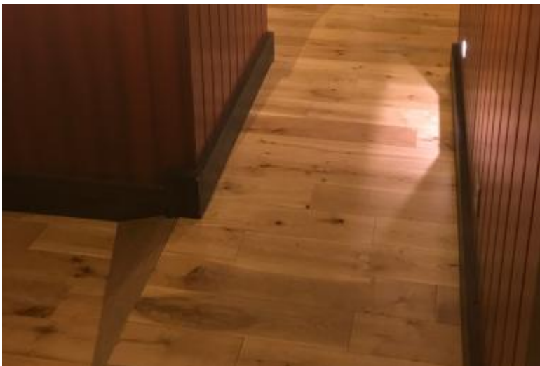
Ramp to toilet