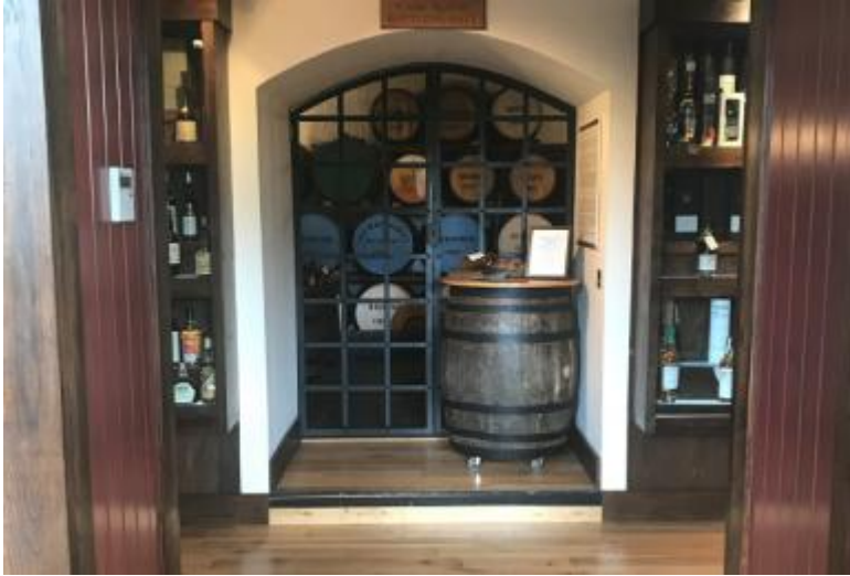
Cask room entrance