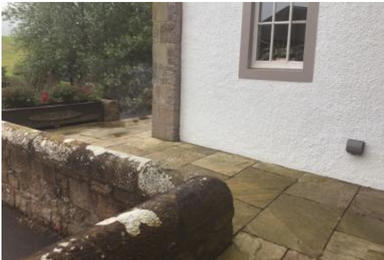
Ramp access pathway