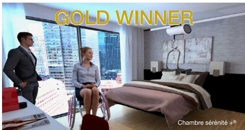
Chambre sérénité + ®

Furthermore, the concept of the "Serenity+ ® " room is a world-unique accessible room that can be offered as one of the accessible rooms. This concept won the prestigious Gold Winner at the Architecture & Design Collection Awards 2022. This room provides unparalleled accessibility comfort for people with reduced mobility. Imagine, from their bed, occupants can be effortlessly transferred to the bathroom, with washing toilets and a wall-mounted shower seat.