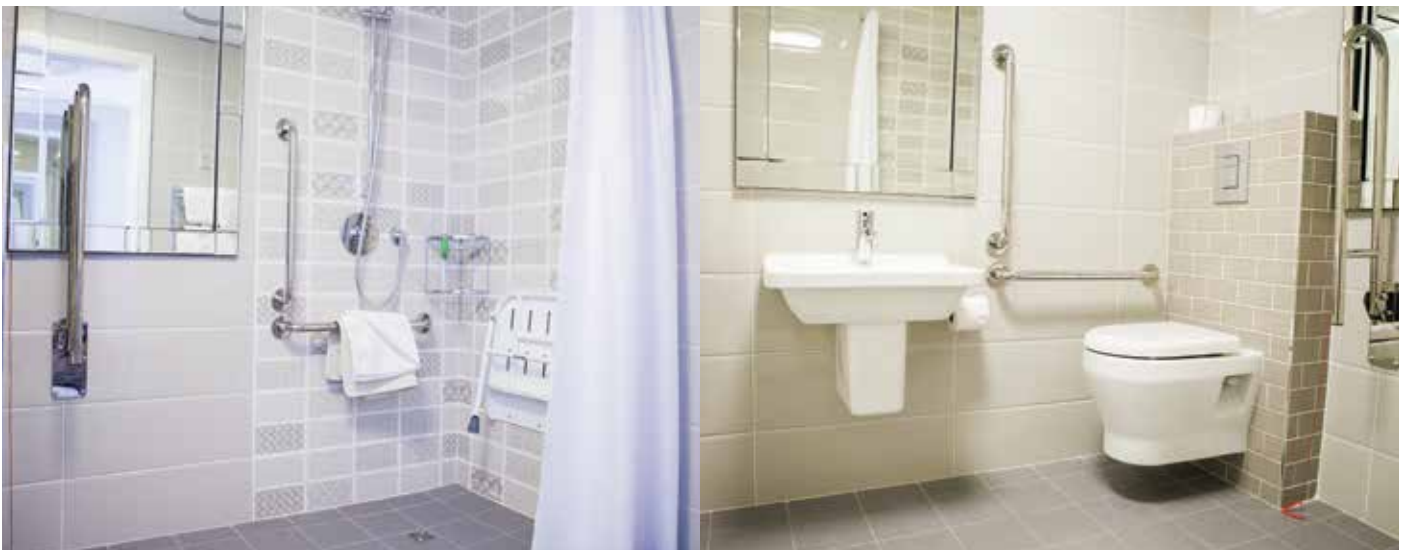
Typical en-suite bathroom with roll-in shower (Room 132)