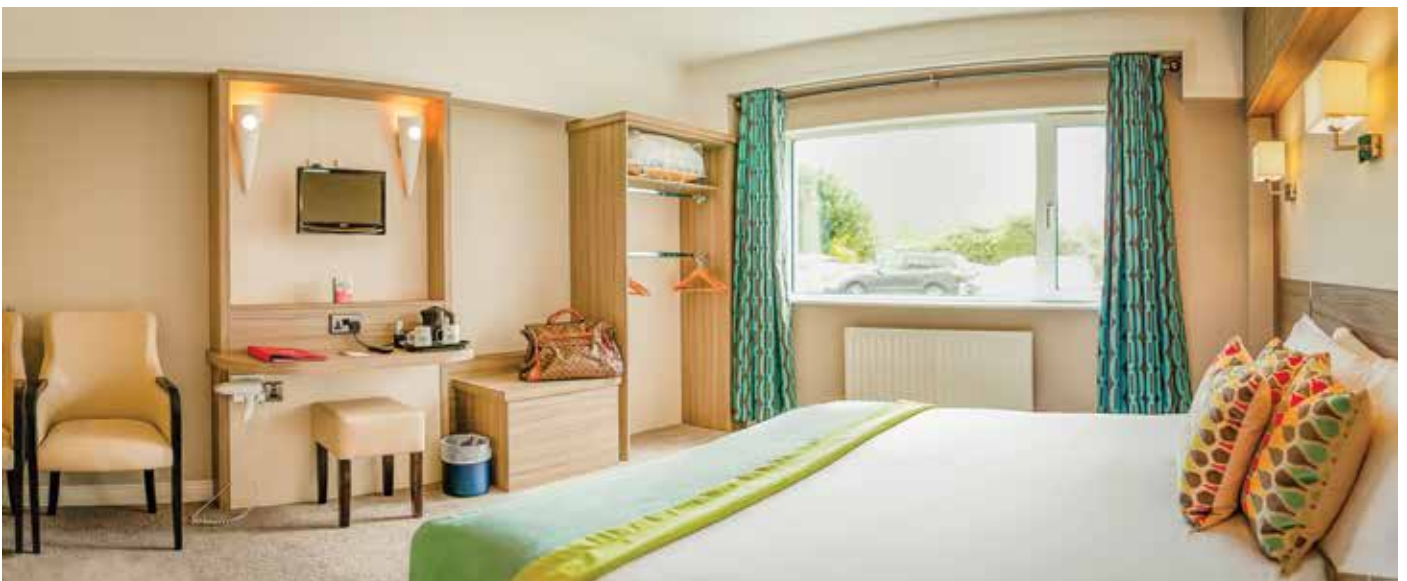
Accessible Guestroom (number 126)

We have 244 guest rooms, 11 accessible rooms with 68 walk in showers and 5 fully accessible rooms including 1 fully accessible room with wooden floor suitable for persons with allergies. All rooms are equipped with tea/coffee making equipment, TV, Telephone, Hair dryer, Toiletries, Luggage rack, wardrobe and Room Safe.