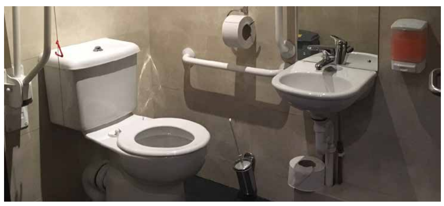
The Ground Floor Accessible Toilet

There are three public use accessible toilets: one on the Ground Floor next to the Reception Area, one on the 1st floor close to the Windward Suite and one in the Leisure Centre.